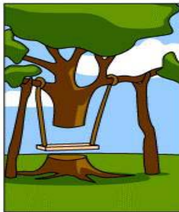
How the Analyst designed it