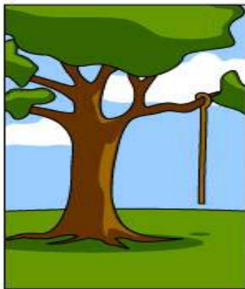
What operations installed