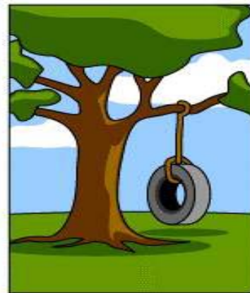
What the customer really needed