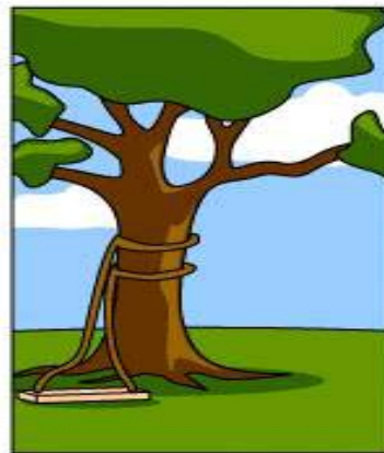
How the Programmer wrote it