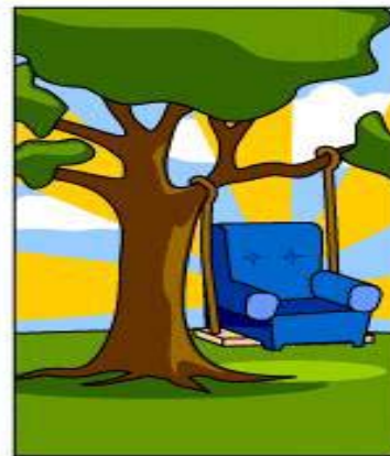
How the Business Consultant described it