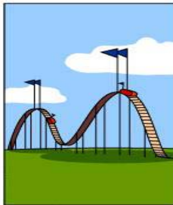
How the customer was billed