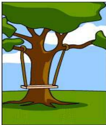
How the Project Leader understood it