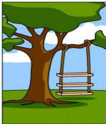
How the customer explained it